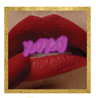
EVERY TUESDAY | 8PM TO 12AM WORLDWIDE MUSIC

GENTS PACKAGE BUY 2 DRINKS & THIRD ONE IS ON US