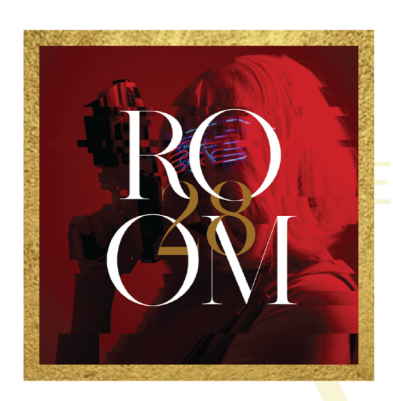
7PM TO 2AM HOUSE MUSIC BY DJ ALEX