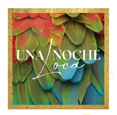
EVERY SATURDAY | 7PM TO 2AM LATIN MUSIC 25% ON FOOD AND BEVERAGES FOR CABIN CREW, HOTELIERS, TEACHERS AND HEALTHCARE WORKERS