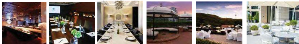
Crystal Ballroom Boardroom A&B Festa Hall Festa Rooftop Bar Namsan Terrace Festa Garden