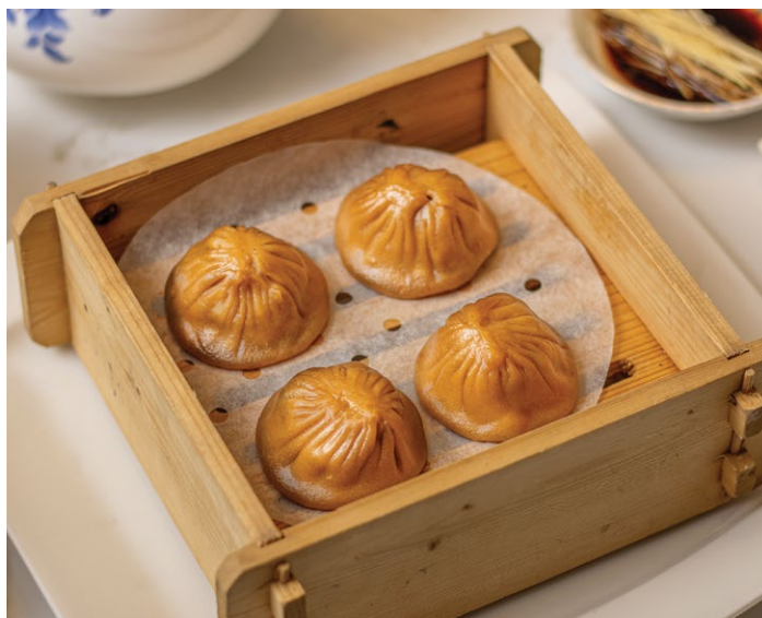
☆ 北海道昆布高湯蟹肉小籠包 Steamed "Xiao Long Bao" filled with Hokkaido Kombu Soup and Crab Meat