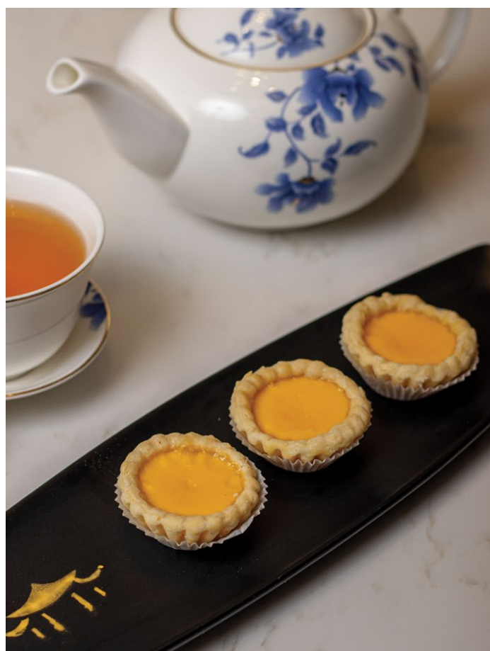
酥皮蛋撻 🍷 🍷

Crispy Yam Puff filled with Chicken and Mushroom