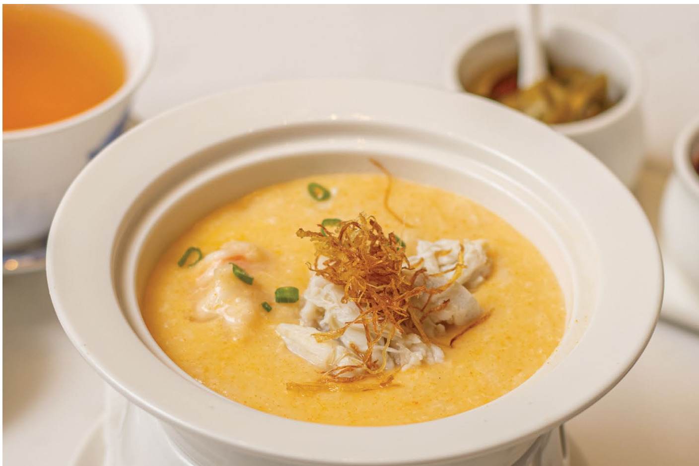
☆ 蟹皇海鮮粥 Congee with Seafood and Crab Roe