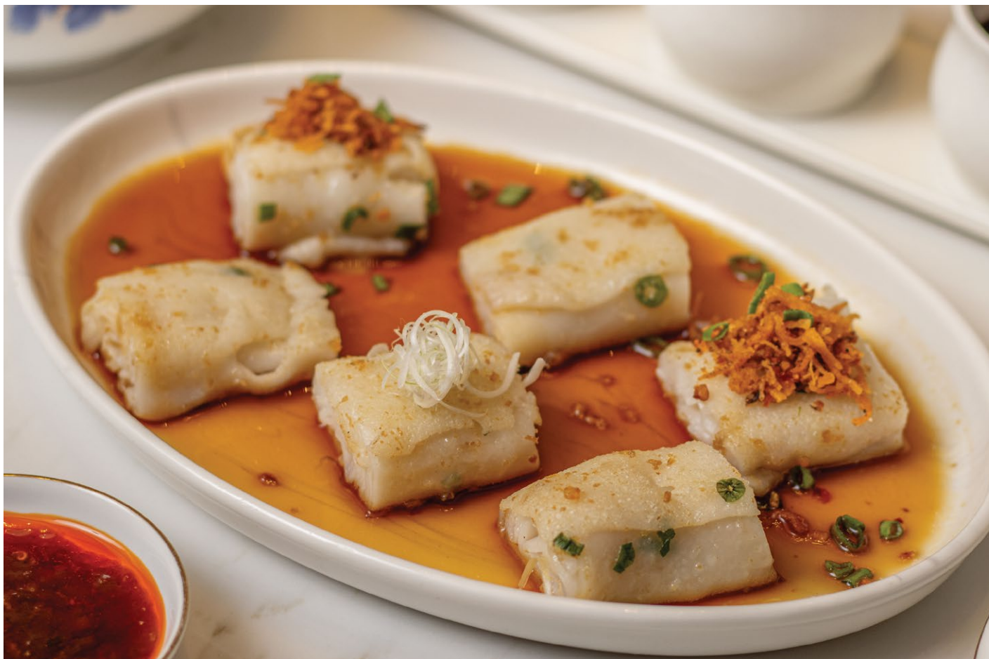
☆ 香煎極醬玉帶腸粉 Steamed Rice Roll with Pan-fried Scallop in Supreme Spicy Sauce