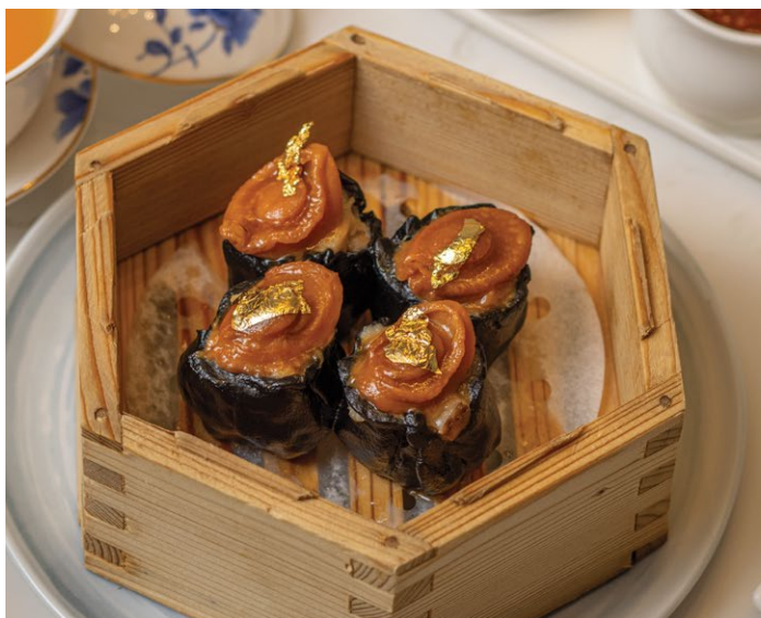
☆ 鮑魚燒賣皇 Steamed Prawn and Chicken Dumpling with Abalone