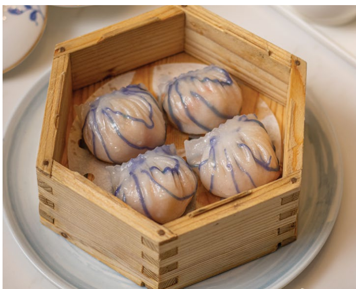
☆ 芋螢瑤瑤蝦餃 Steamed Crystal Prawn Dumpling with Sun Dried Scallop