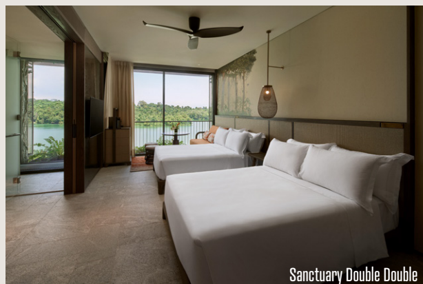
Sanctuary Double Double