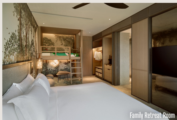
Family Retreat Room