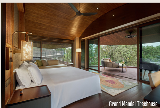
Grand Mandai Treehouse