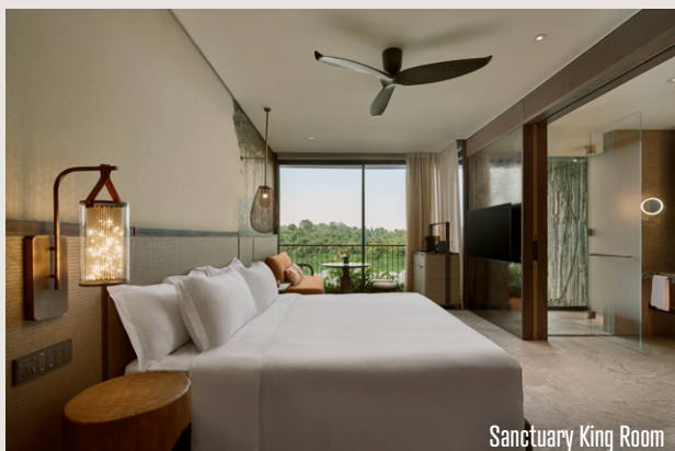
Sanctuary King Room