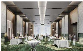
Nanjing Garden Ballroom