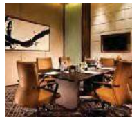
Jintang Meeting Room