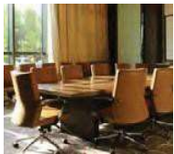
Beian Meeting Room