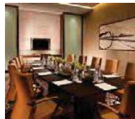
Jinbu Meeting Room